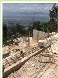
Initial construction of levels 1-2-3-4 into mountainside

Two buildings have been constructed for storing of materials and construction of the back wall for each level is underway. The 1 st level building is planned to open in September for the mobile clinic.