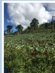
Cabbage crop early February 2018