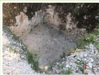
10 cubic-meter reservoir in progress

The first and most essential construction phase, the building of a reservoir to capture and supply the clinic with rainwater, has been completed. Local villagers manually dug two 10 cubic-meter holes and poured the cement walls. These reservoirs under the 4 th level hold approximately 10,000 liters of water each.