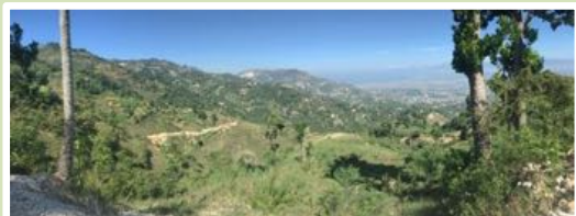
View from site in Marlique