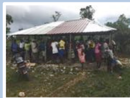
Gathering of Montagnac Community Leaders for distribution of seeds