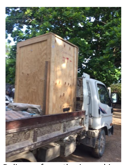
Delivery of anesthesia machine

When our bus finally arrived in Dame-Marie after the ten-hour marathon ride, we were greeted out front at the hospital by the sight of our newest equipment donation. A workhorse anesthesia machine that can be used by any trained anesthesia members arriving from almost any country.