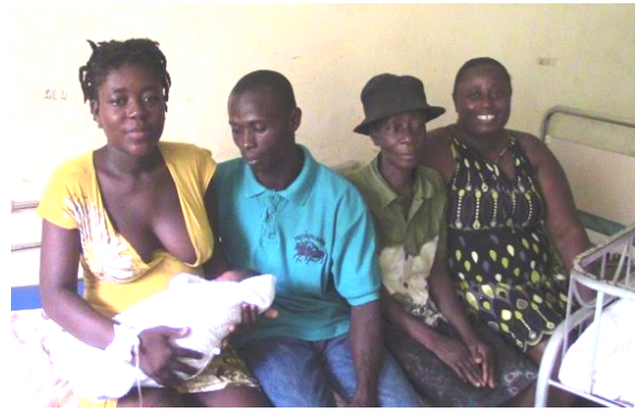
New mother, newborn, father, grandmother and aunt