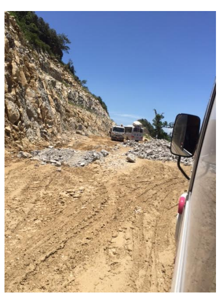
Land slide on road to Dame-Marie

The weather report for the week that we served in Dame-Marie – hot, hot, and hot.