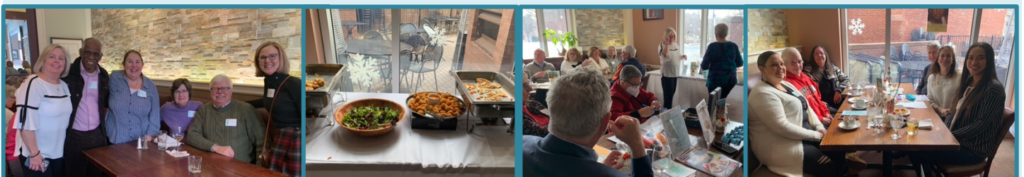
Veteran Mission Team Members from the Early Days