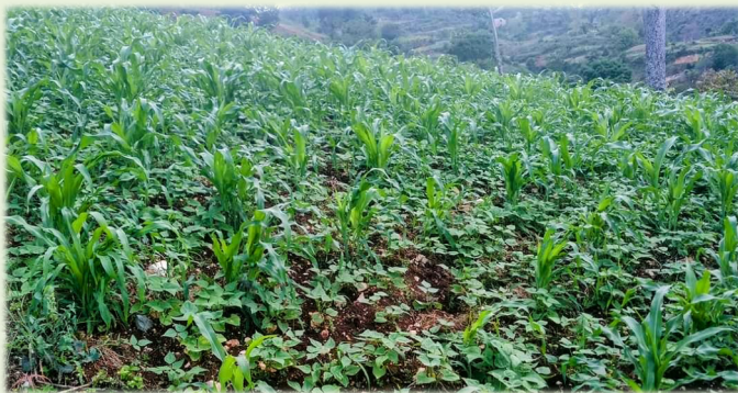
June (Nutrition) A field of corn and green beans in the Community Garden at HBLM