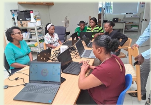
July (Operations) Electronic medical records training