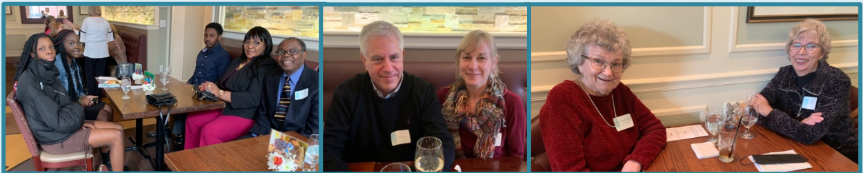
Friends, Family, and Supporters