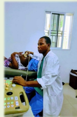
Maternal Health Care