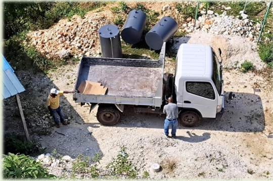
January (Facility) Installation of three (3) reserve fuel tanks

Despite the daily risks and difficulties of violence, kidnapping, inflation, and shortages, the stories of hope generated by staff efforts and patient outcomes continue through your support and generosity.